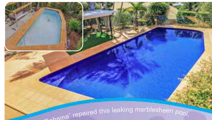
Aqualux 'Bahama' repaired this leaking marblesheen pool.

World class technology, industry-leading techniques and over 40 years experience combine to ensure every single Aqualux pool finish is crafted with absolute precision and unrivalled quality - so you can be confident your pool will remain water-tight for many years to come.