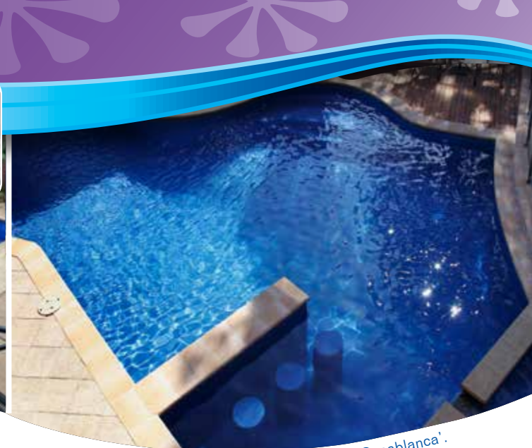
This unique pool looks amazing in Aqualux 'Casablanca'.

Pool owners converting to Aqualux from pebble or tiled finishes are always amazed at how much easier it is to keep an Aqualux pool fresh and clean.