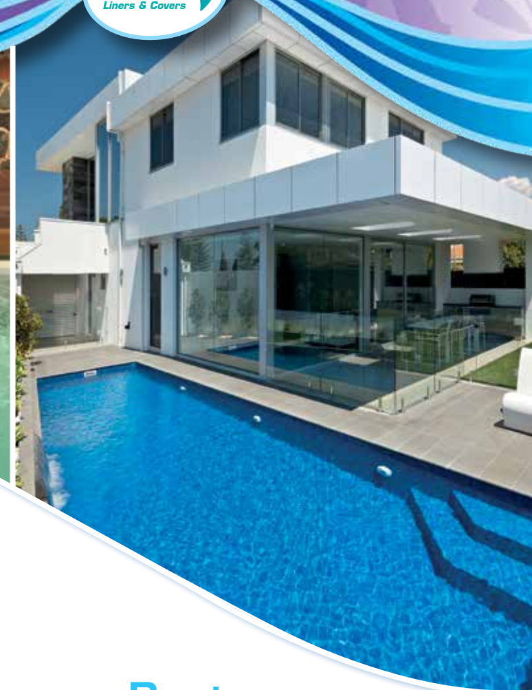
Front Cover: Aqualux 'Bahama'