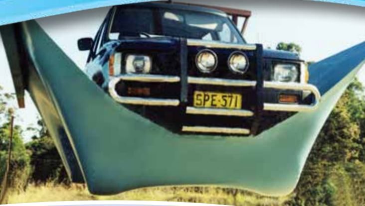
Aqualux supports the weight of a 4WD in this show of strength