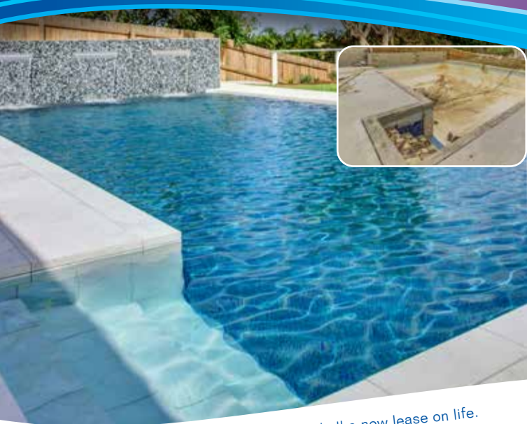
Aqualux 'Antique' gives this concrete shell a new lease on life.